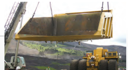
HT-930E-OB-1000 – Komatsu 930E (320 ton payload) SMS curved canopy design. Location: Fort McMurray, AB