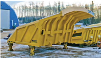
HT-C797-B1-1000 – Cat 797 (400 ton payload) overburden truck body. Location: Fort McMurray, AB