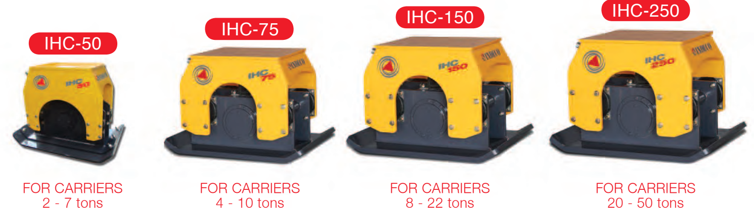
FOR CARRIERS 2 - 7 tons